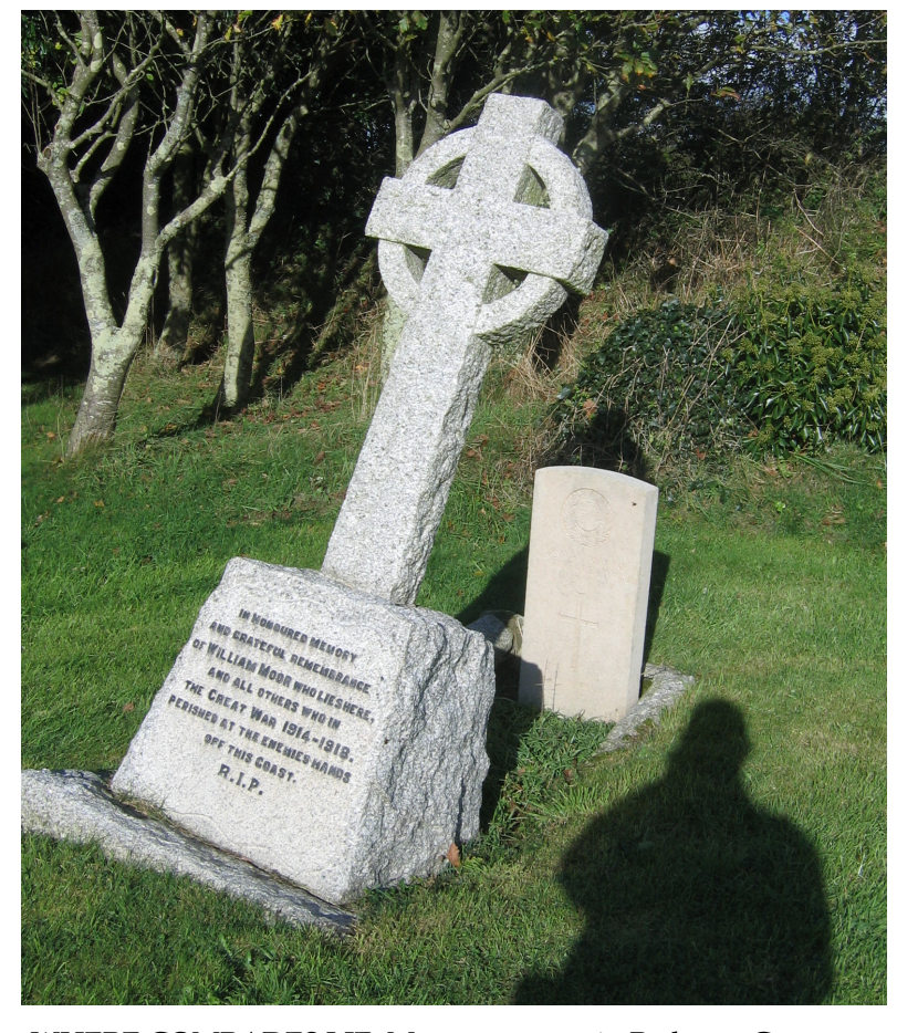
WHERE COMRADES LIE: Mystery graves in Padstow Cemetery

The other headstone, a much plainer affair which was erected by the