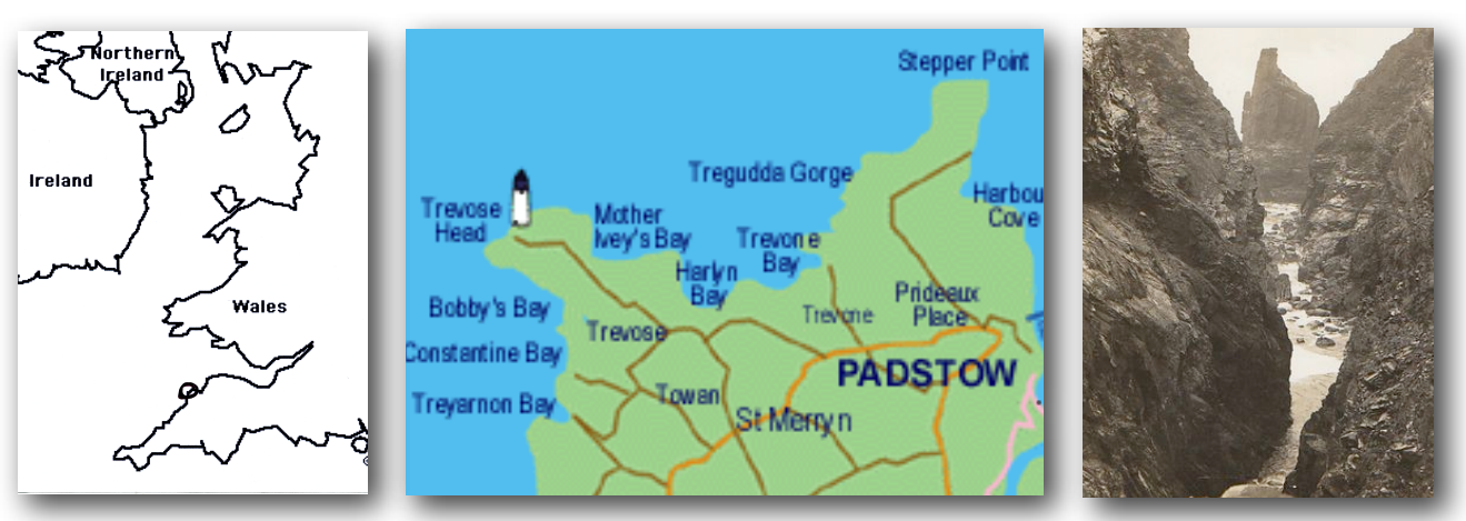
DEADLY: (Left) U-boat Alley with Trevose Head ringed. (Centre) Padstow coastline. (Right) Tregudda Gorge